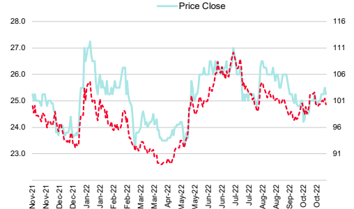
Charoen Pokphand Foods (CPF TB)